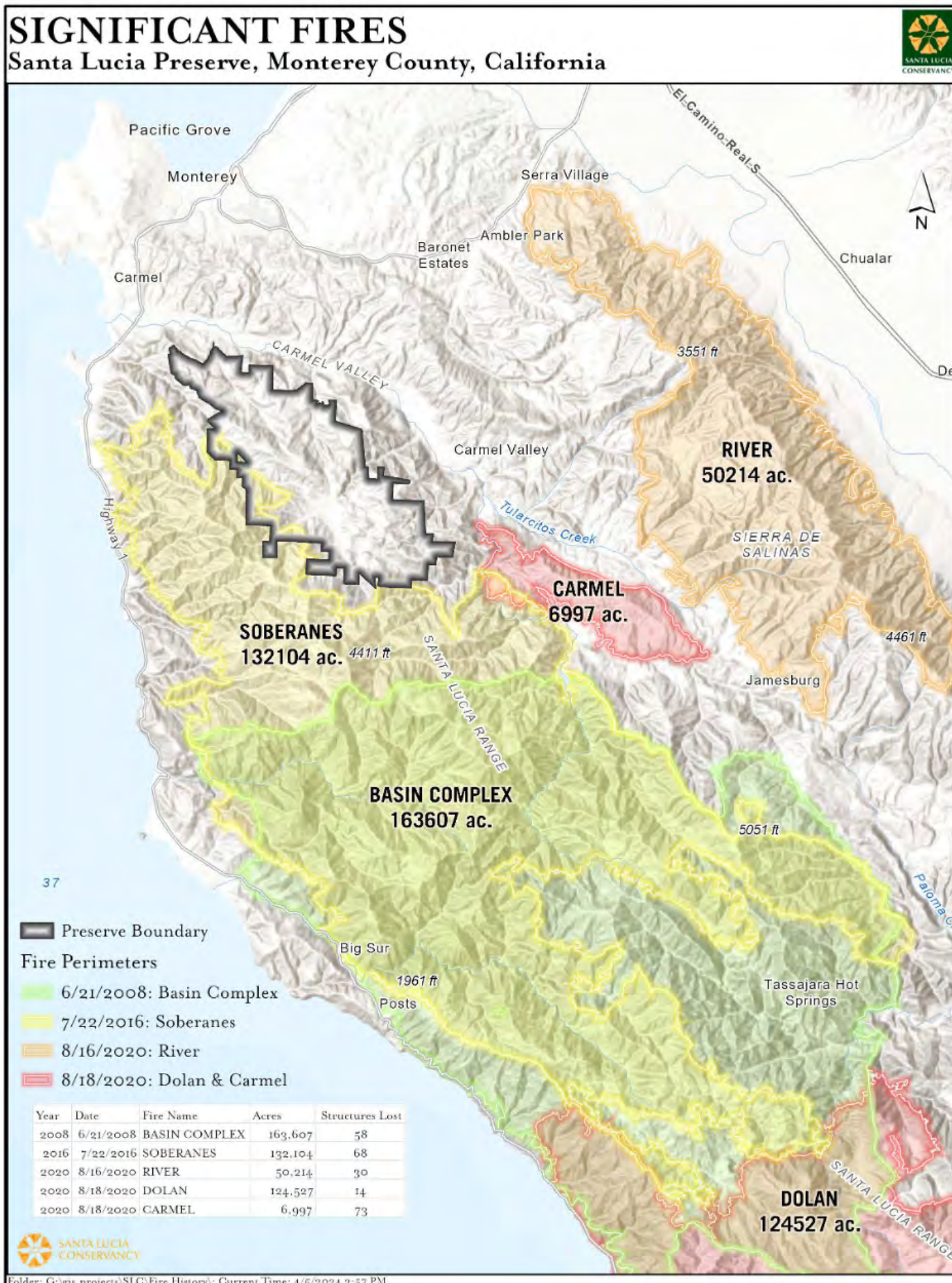
Figure 1. Significant wildfires near the Santa Lucia Preserve over the last 15 years.